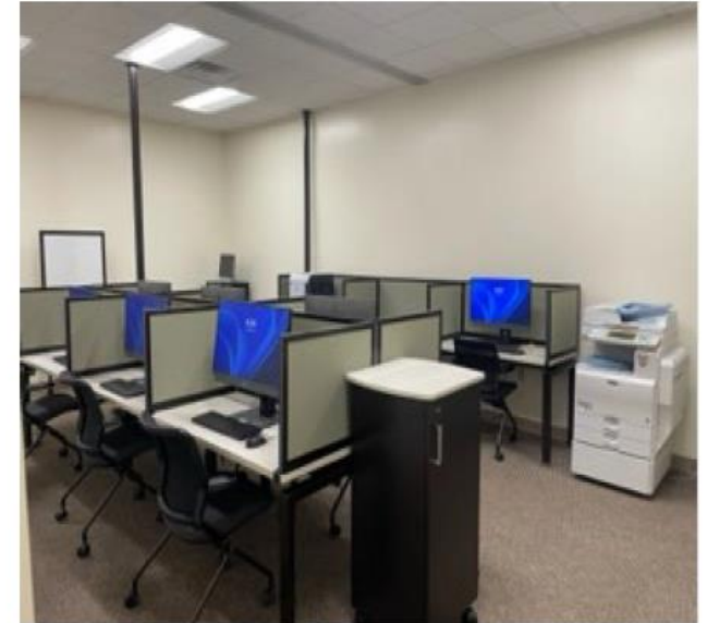
Computer Training Lab with all in ones, printer and projector