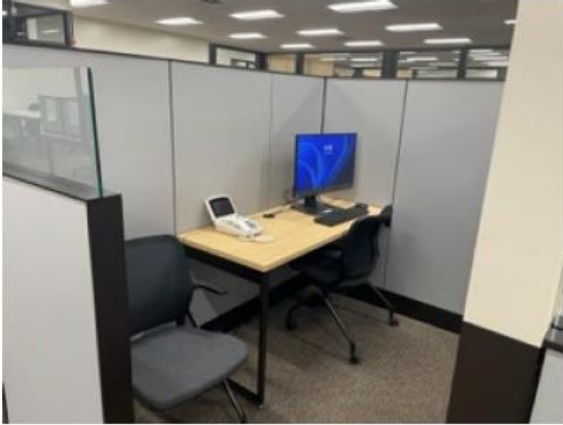
Wheelchair accessible client cubical with accessible technology

Increased functionality and accessibility for client areas