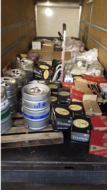
Empties on Delivery Truck – End of Day