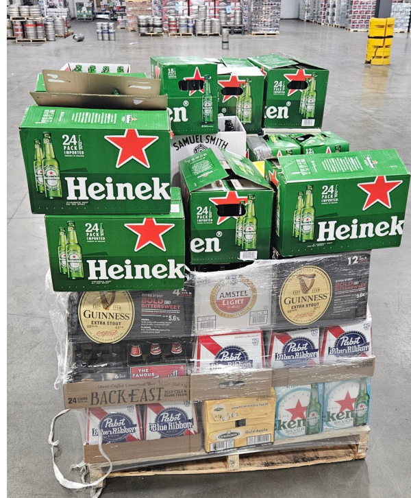
Manually palletized for counting, storage + pickup