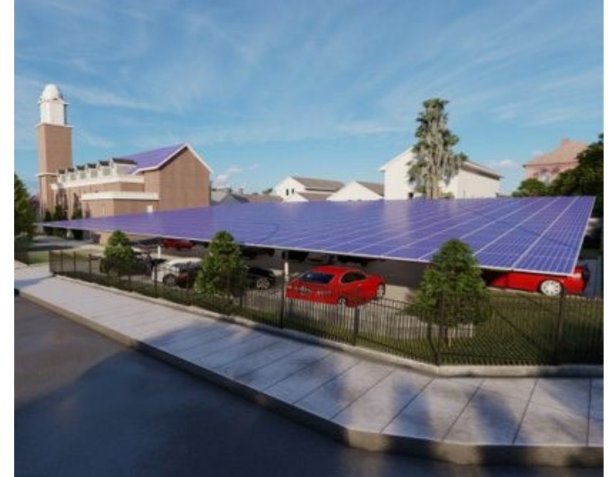
265 Manton Ave, Providence, RI