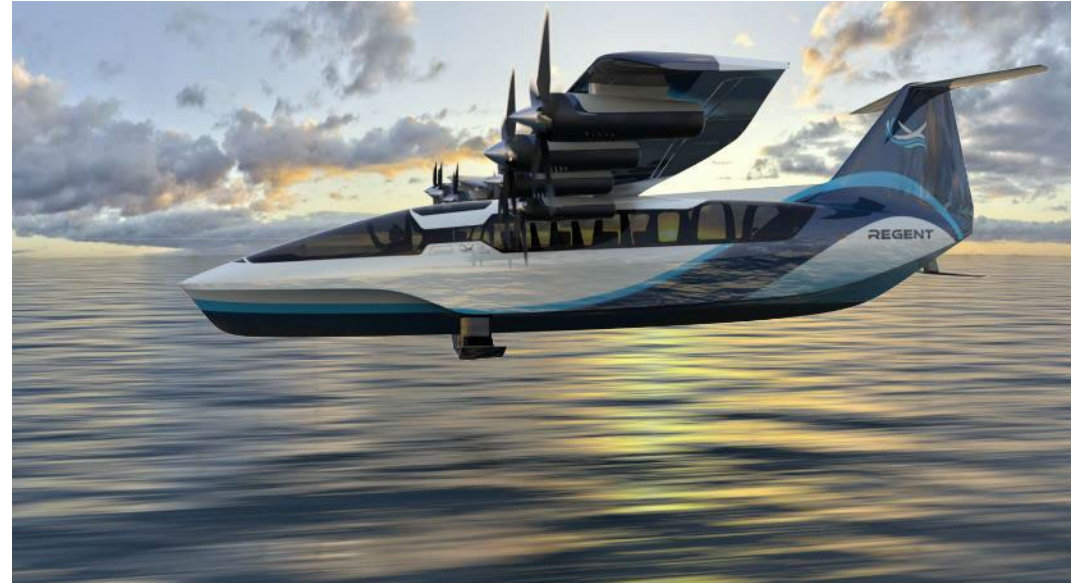
Regent Craft, North Kingstown

*The anticipated total gross value is based upon original project underwriting on hiring estimates and salaries provided by the participant companies. The annual actual value of the tax credits will be based on the actual job data certified on an annual basis.