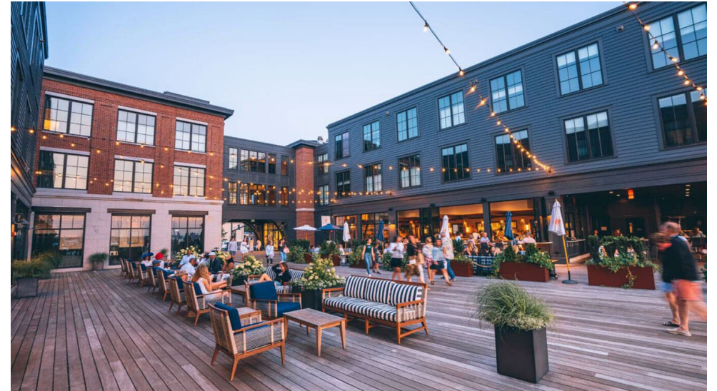
Hammett Wharf Hotel (Newport)