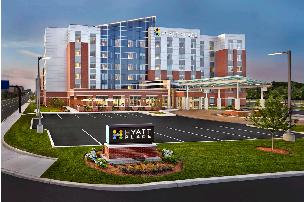
D'Ambra Hotel (Warwick)