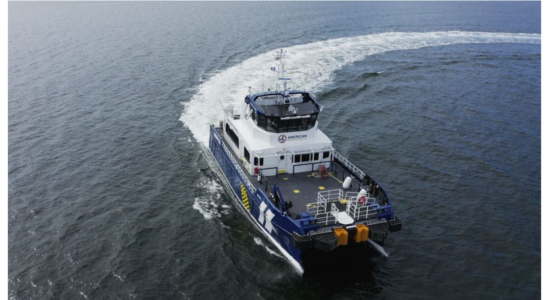
American Offshore Services