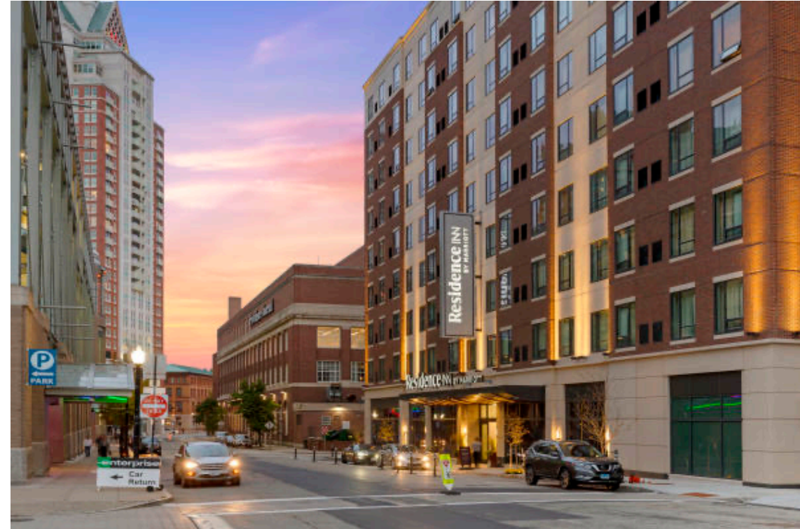
Residence Inn (Providence)