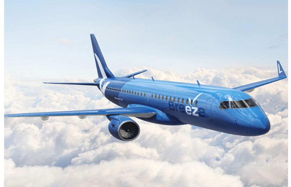
Breeze Airways, Warwick

*The anticipated total gross value is based upon original project underwriting on hiring estimates and salaries provided by the participant companies. The annual actual value of the tax credits will be based on the actual job data certified on an annual basis.