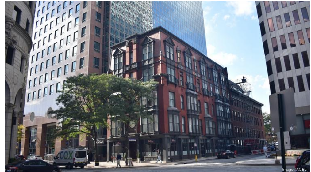
Beatrice Hotel (Providence)