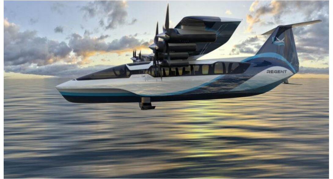
Regent Craft (Quonset Airport, RI)

*The anticipated total gross value is based upon original project underwriting on hiring estimates and salaries provided by the participant companies. The annual actual value of the tax credits will be based on the actual job data certified on an annual basis.