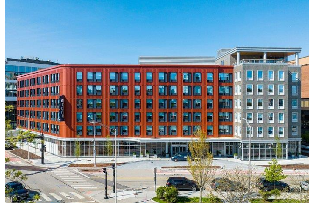
Aloft Hotel (Providence)