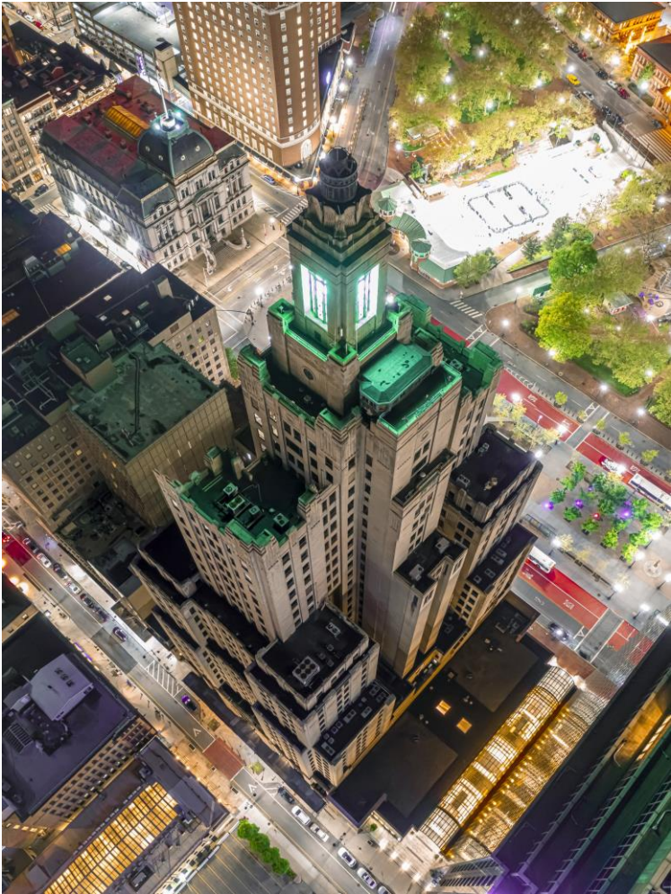
111 Westminster Superman Building