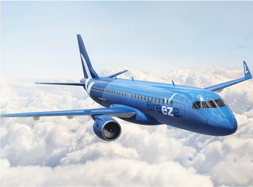
Breeze Airways, Warwick