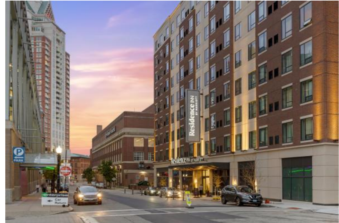
Residence Inn (Providence)