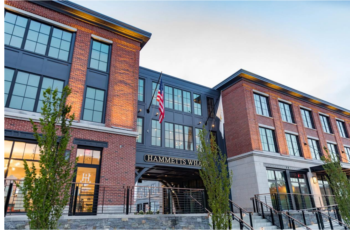
Hammett's Wharf (Newport)

*The estimated TIF estimates for FY 2021 & FY 2022 are based upon Commerce Corporation original underwriting and have NOT been adjusted for COVID-19 impacts