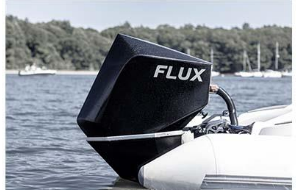
Flux Marine (East Greenwich)

*The anticipated total gross value is based upon original project underwriting on hiring estimates and salaries provided by the participant companies. The annual actual value of the tax credits will be based on the actual job data certified on an annual basis.