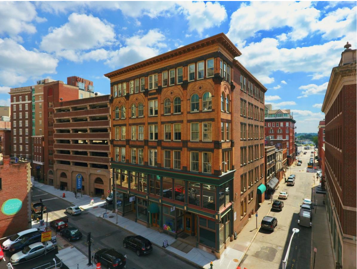
The Studley Building (Providence)