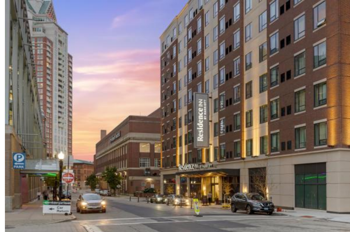
Residence Inn (Providence)