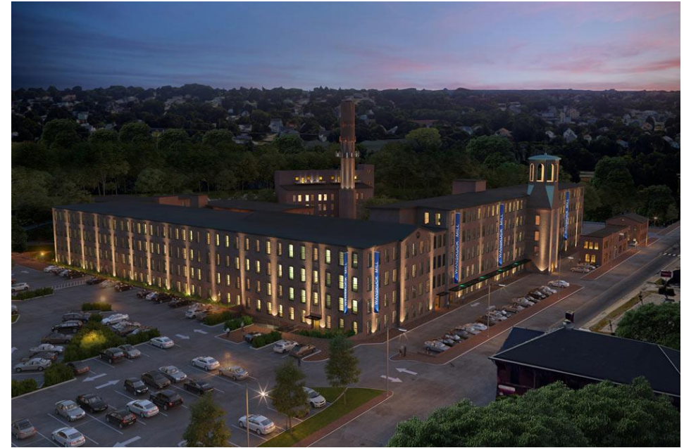
Wanskuck Mill (Providence)