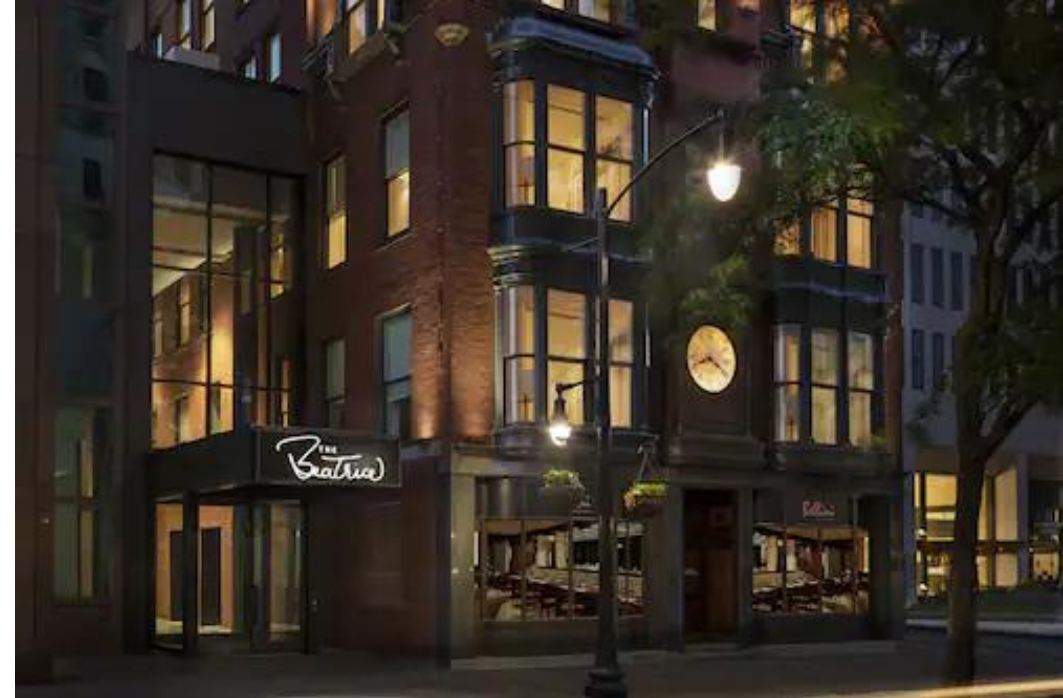
Hotel Beatrice (Providence)