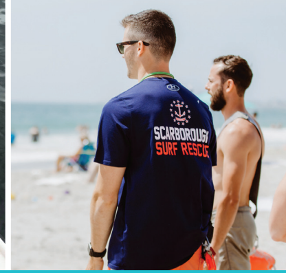
Lifeguard Certification Testing