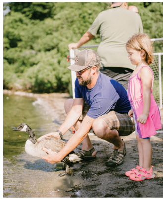
1. A bicyclist passes a RI State Park staff person mowing grass along the East Bay Bike Path. 2. A farmer holds up a bag of RI Grown crops for sale at the weekly Goddard Memorial Farmers Market. 3. Volunteers and state biologists at a goose banding program led by DEM's Division of Fish & Wildlife.