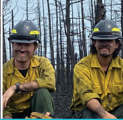
Div. of Forest Environment, Wildfire Mutual Aid