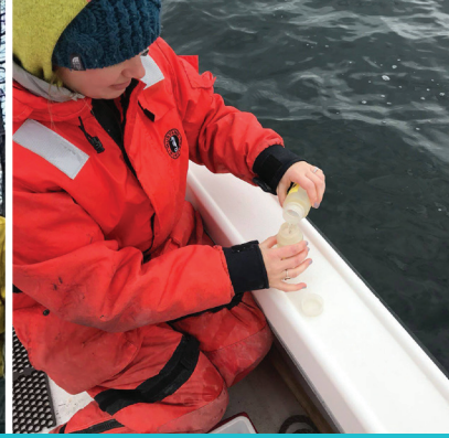
Office of Water Resources, Shellfish Water Quality