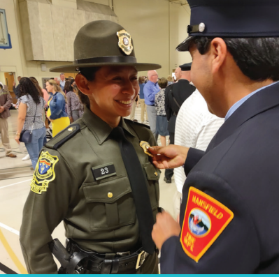
Div. of Law Enforcement, Academy Graduation