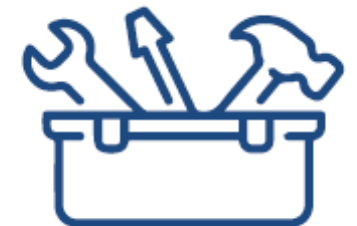
Health & Safety Repairs