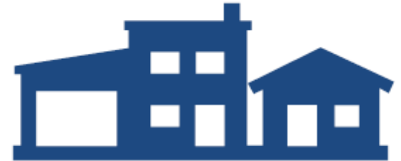
Accessory Dwelling Units