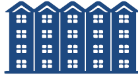
Building Homes Rhode Island + (BHRI) Funds