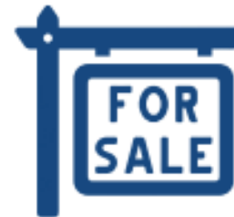
Property Purchase and Rehabilitation