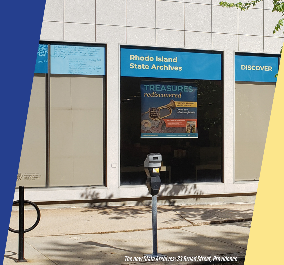
The new State Archives: 33 Broad Street, Providence