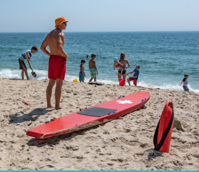
Salty Brine State Beach in Narragansett