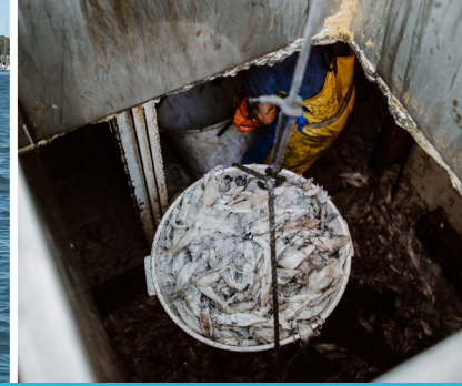
Unloading squid at the Port of Galilee