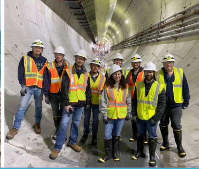
Office of Water Resources Staff