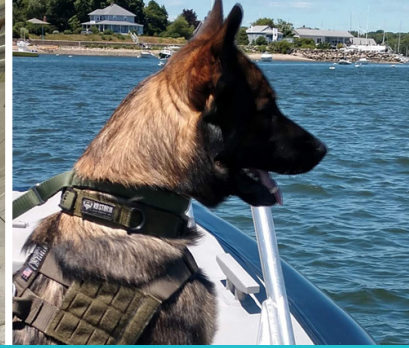
DEM Law Enforcement K9-Grizzly